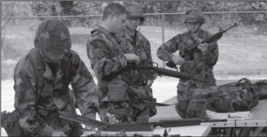
908CES members clean weapons prior to turning them in to the field armory.

Portions of the wing participated in an enemy attack response exercise Nov. 5. Wing Performance Plans Officer Maj. Troy Vonada said the exercise met all objectives. The exercise focused on two key stressors, command and control and dressing out in chemical warfare gear. Unit Control Centers, the Survival Recovery Center, Wing Operations Center and the Wing Command Post received close attention. Evaluators noted that sense of urgency, communication of alarm conditions, proper wear of chemical warfare gear and possessing the airman's manual are areas for improvement. "I was pleased with what was accomplished. We're an outstanding wing and have the experience, knowledge and will to surpass expectations that any IG team can throw at us. More importantly, we've got ample time to prepare for the next ORI," Major Vonada said. A command and control tabletop in the Spring and another enemy attack exercise in the Fall are tentatively planned.