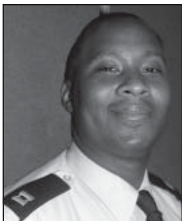
By Chaplain (Capt.) Val Shumate 908th AW Chaplain's Office

Today many American military members are separated from their loved ones around the globe. Since September 11, 2001, the ranks of military members serving in active duty status have increased considerably.