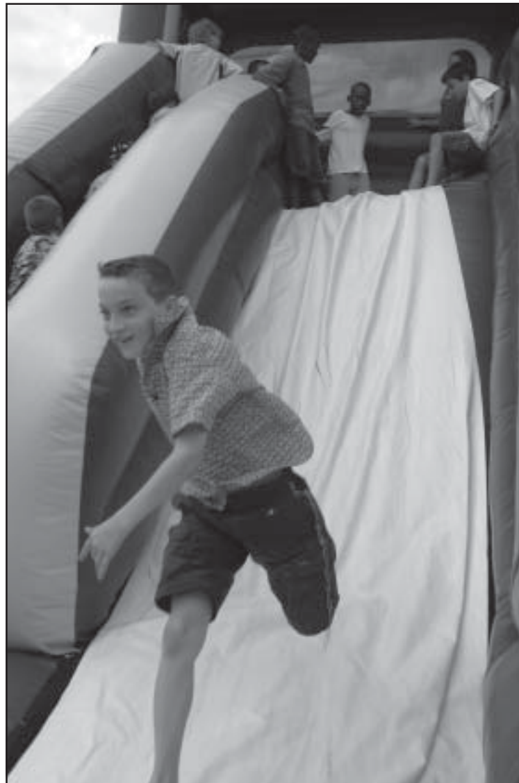
Kids just wanna have fun !