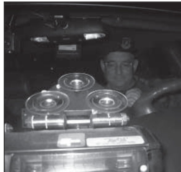
Many patrol cars are outfitted with A/V recorders.

They repeated the operation for the next two nights; issuing 51 citations. The third night, no citations were issued.