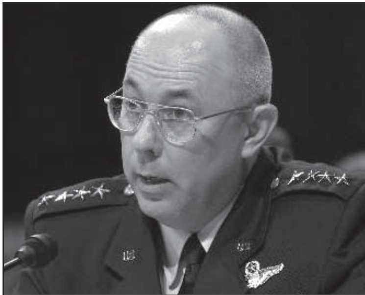
Gen. T. Michael Moseley

"General John Jumper has set the highest standards for our service as we've conducted operations with our