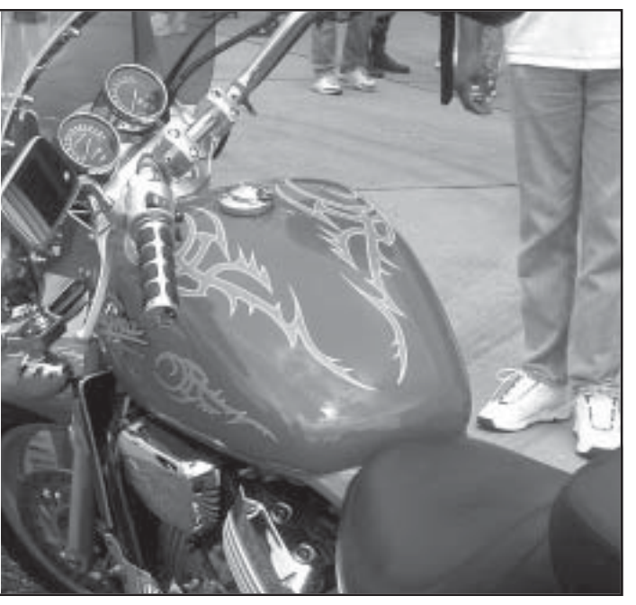
orter gets ready for last year's viewers' choice motorcyle contest.