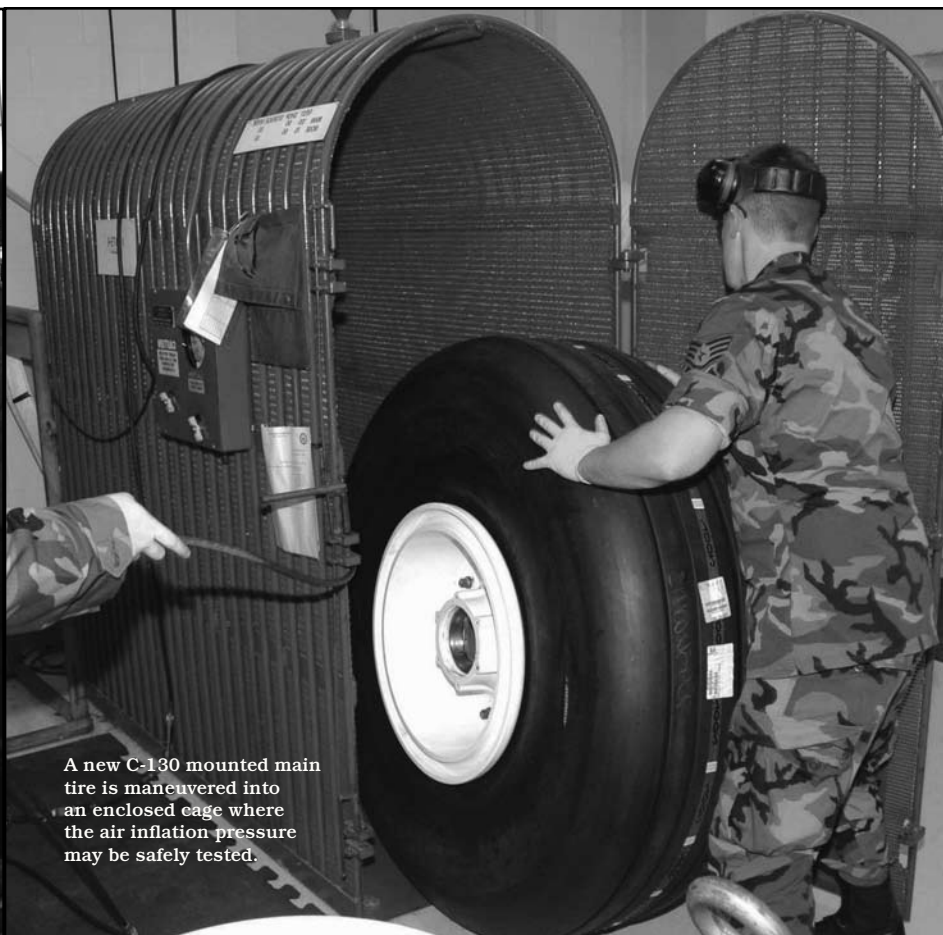
A new C-130 mounted main tire is maneuvered into an enclosed cage where the air inflation pressure may be safely tested.