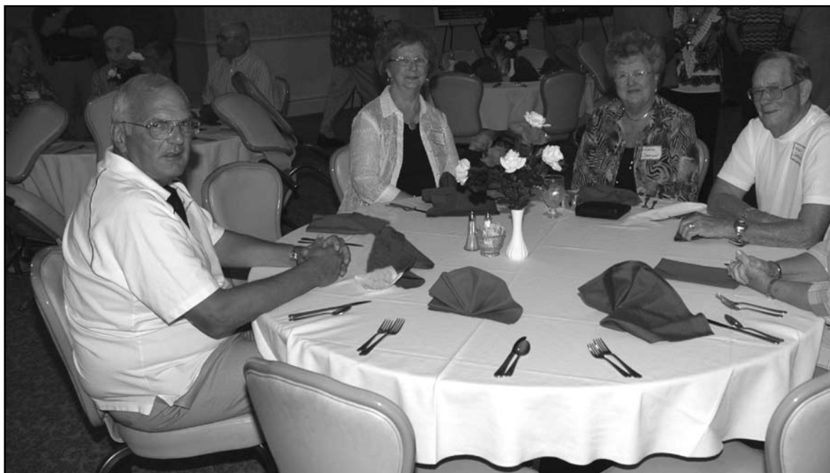
Current and former 908th AW members, spouses and guests gathered at the Falcon's Nest Club on Gunter Annex Sept. 8 for the annual alumni social and dinner.

Senior Air from 22nd Quarter: O ter Sgt. Ge Grade Offi