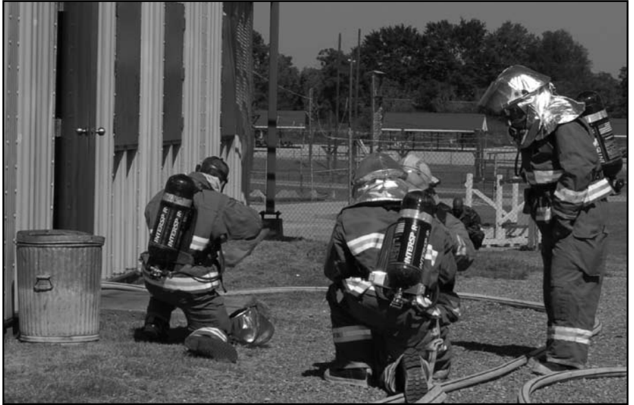
908th firefighters preparing to make entry during the structural exercise.