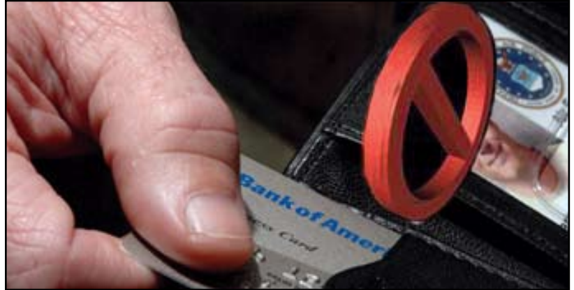
Modified Air Force graphic

With the holidays just around the corner, 908th Airlift military and civilian members are reminded not to make the simple mistake of using the wrong credit card to make purchases. The Government Travel Card is available to Department of Defense employees with the strict understanding that it will not be abused or misused in any way. Use of the GTC is a benefit, not an entitlement, and misuse or irresponsibility can reflect negatively on your credit and your career. So remember, the GTC may only be used for official travel purposes when on official government orders; never for personal use. Pay attention when making personal purchases and make sure you don't use the GTC.