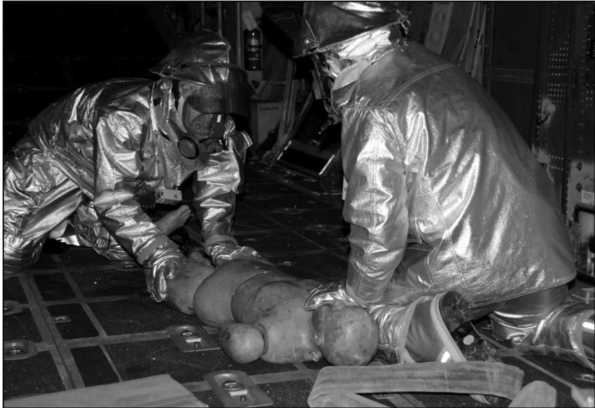
908th firefighters simulate rescuing a victim in the aircraft egress exercise.