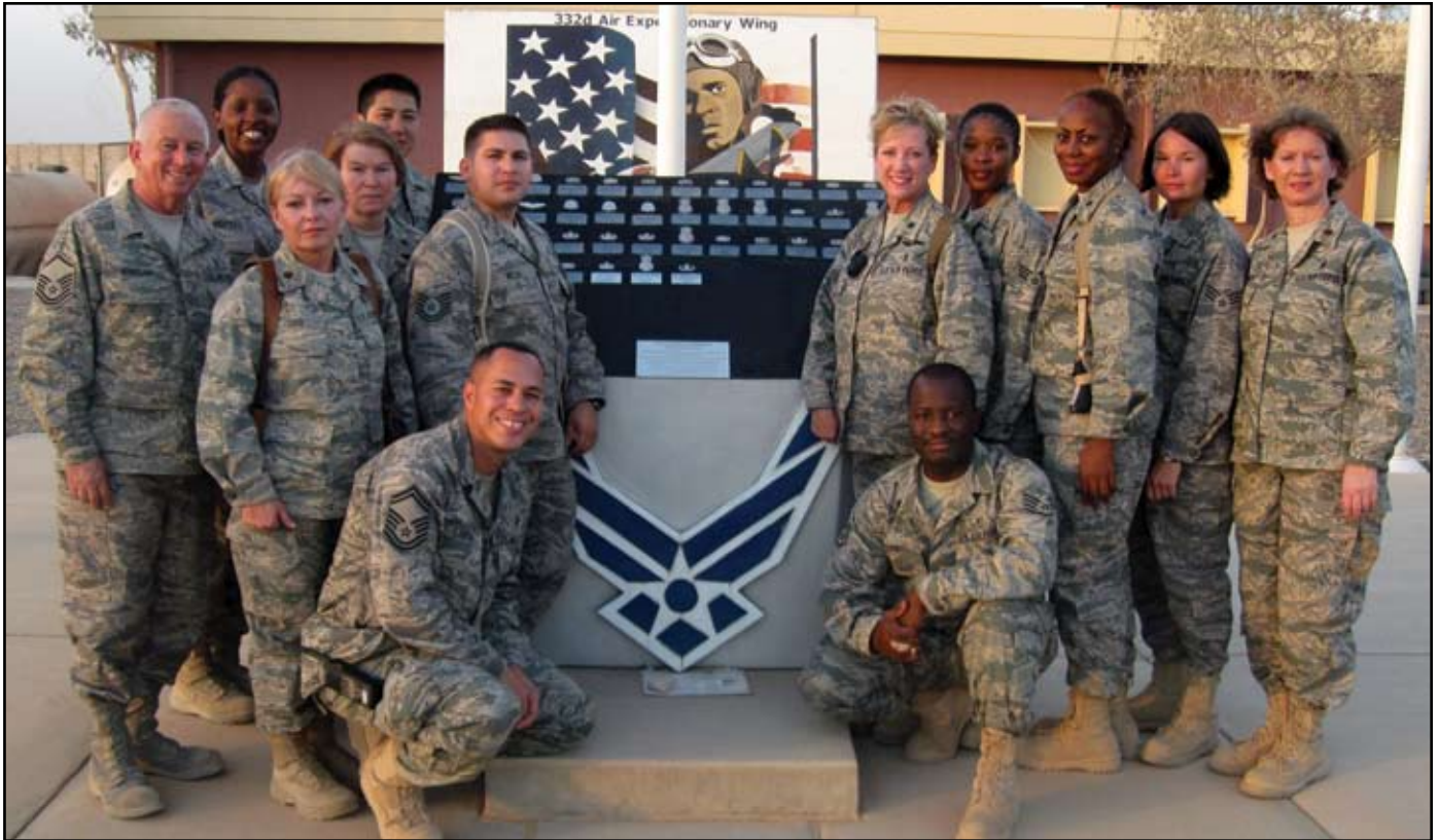
Deployed 908th ASTS members pose for a group photo at Joint Base Balad, Iraq.