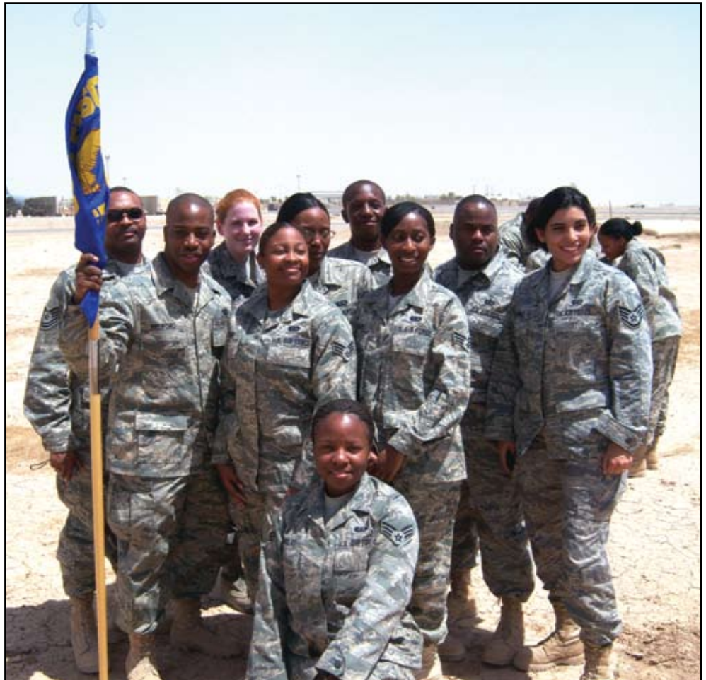
Deployed 908th SVF members pose for a group photo at Joint Base Balad, Iraq.