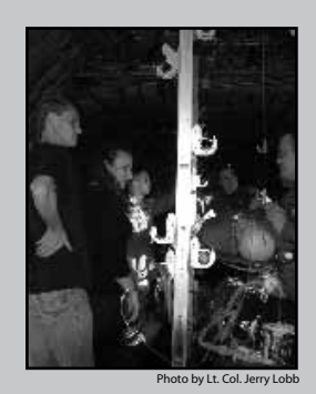
-- Public Affairs Specialist

The chapel provides all Airmen - regardless of rank or faith group - with a safe place for confidential counseling, advice and support. Chaplains are highly trained pastors and counselors that can give you guidance during both the high and low points that occur in your life. Chaplains are held to a standard of confidentiality that will not be broken.