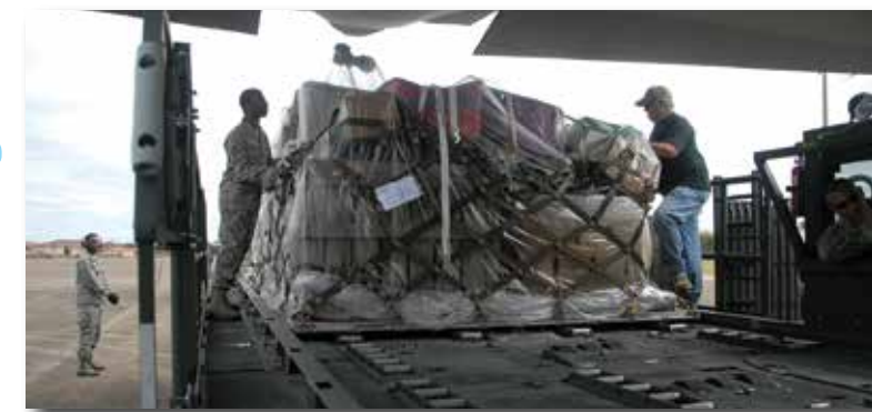
Members of the 25th APS load pallets containing humanitarian cargo aboard a C-130J from the 317 Airlift Group of Dyess AFB Texas.