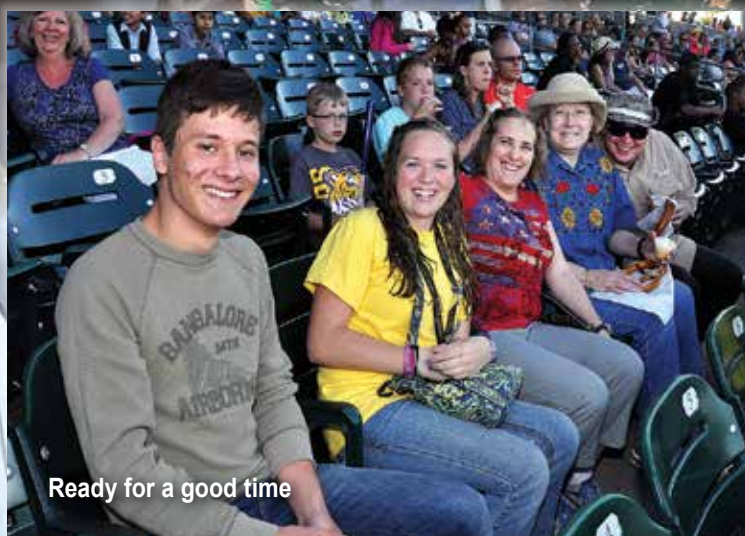
Ready for a good time