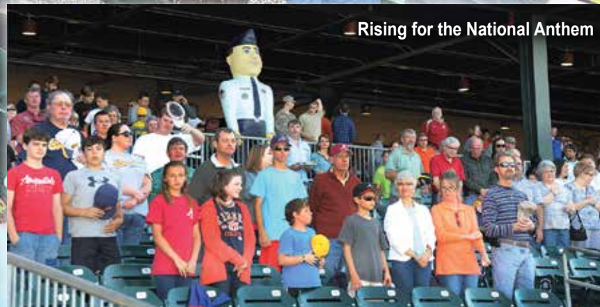
Rising for the National Anthem