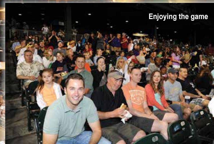
Enjoying the game