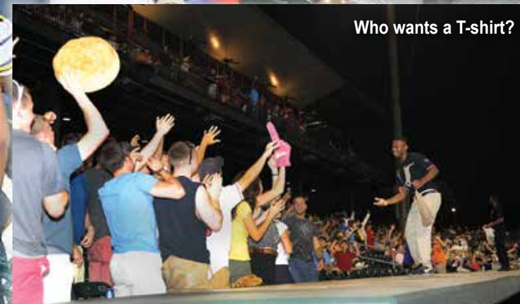
Who wants a T-shirt?