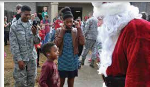
Santa Claus recently visited the 908th AW, greeting families, taking wish list requests and taking photos with the children.