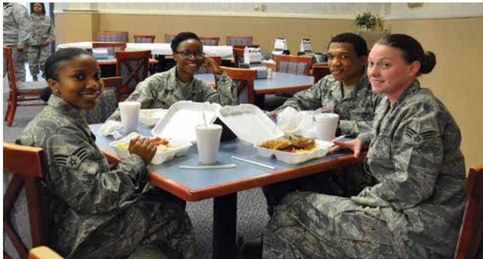
Members of the 908th attend the recent mentoring breakfast.