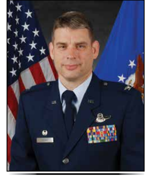
COL. KENNETH OSTRAT Commander, 908th Airlift Wing

What we do is hard. There is no other way to look at it. Not only do we have our