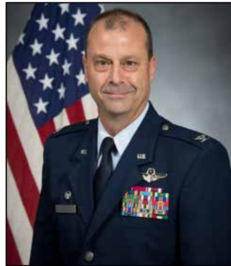
COL. CRAIG DRESCHER Commander, 908th Airlift Wing

In closing, as we navigate our way through the plethora of immensely complicated challenges (preparing 270 airmen for deployment, COVID-19 response, the possibility of re-missioning, the dynamics of race discussions in our community and in our wing) we can always find our way by respecting each other and leaning on our Air Force Core Values for guidance. You all make me proud to serve you each and every day, keep aiming high 908th!